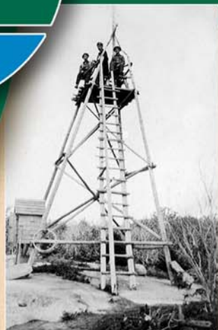
In 19192, the first observer worked on top of twenty high wooden tower. They lived in tents for the first two summers. This was not an easy life.

Tower observers were equipped with maps, range finder, compass, field glasses, radios (later telephones) and food. It could be a lonely eight months—self-sufficiency was required..