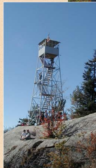
The summit, at 2,350 feet, offers spectacular views of the Fulton Chain of Lakes, Blue Mountain and several high peaks including Mt. Marcy 55 miles to the north.