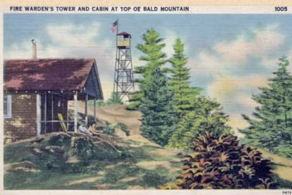
From 1951-1954, an observer lived with his wife and two small children in the 12 x 16 foot cabin from April to November.

The Bald (Rondaxe) Mountain tower, built in 1917, was one of 120 fire towers constructed in New York in the early part of the 20th century. Tower observers reported smoke sightings to forest rangers, documented weather conditions and recorded all planes flying over the Adirondacks during World War II. The tower, closed in 1990, was re-opened on June 18, 2005